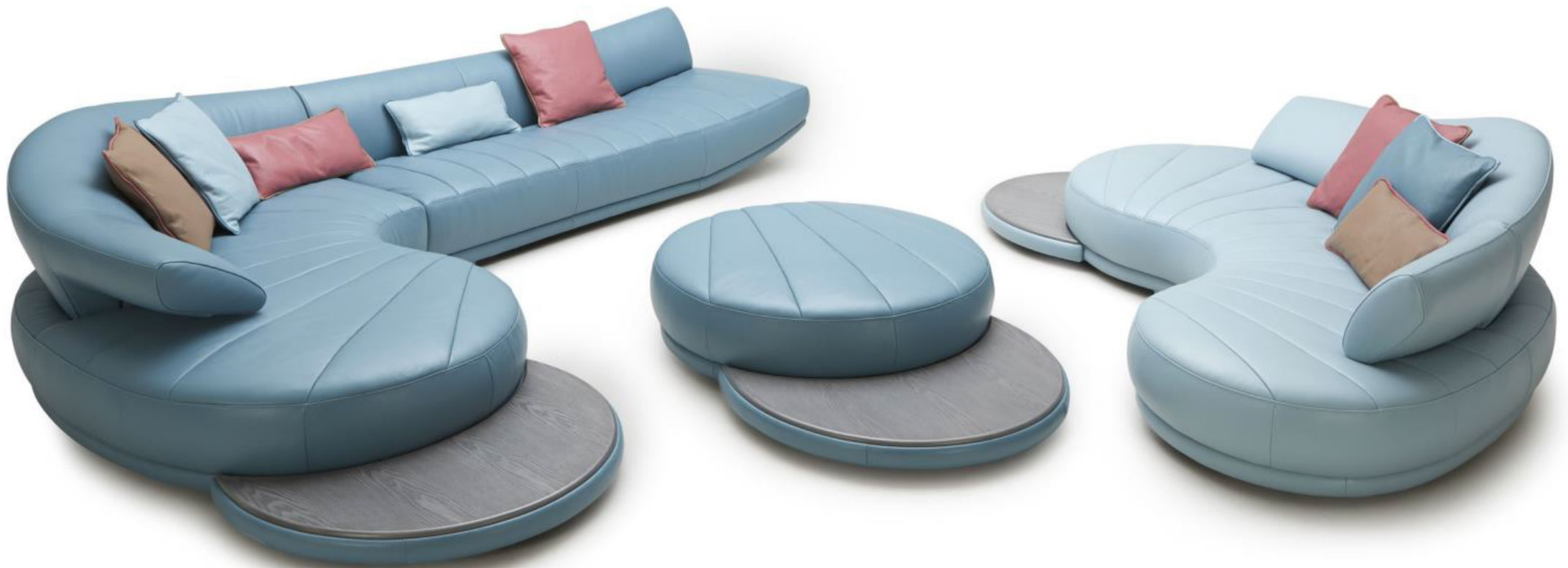
CL(LAF)+3(RAF)+O+HALF MOON CT*3+CL B(RAF)