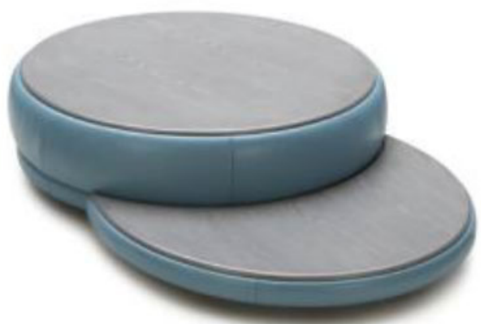
O+HALF MOON CT